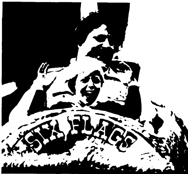
SIX FLAGS SCREAMIN' EAGLE

The Climatron is a geodesic-domed greenhouse that houses four distinct climates ranging from a tropical rain forest to an arid Moroccan desert. A fish pond with an aqua-tunnel allows an intimate view of the silent and mysterious underwater world. The Climatron is just one of a multitude of attractions at the Missouri Botanical Garden located in a pleasant, tree-lined residential area of south St. Louis.